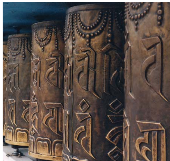
Tibetan prayer wheels in Dharamsala, India where His Holiness resides.

For more information please contact www.mauidharmcenter.org or call 808-579-8076. REMS